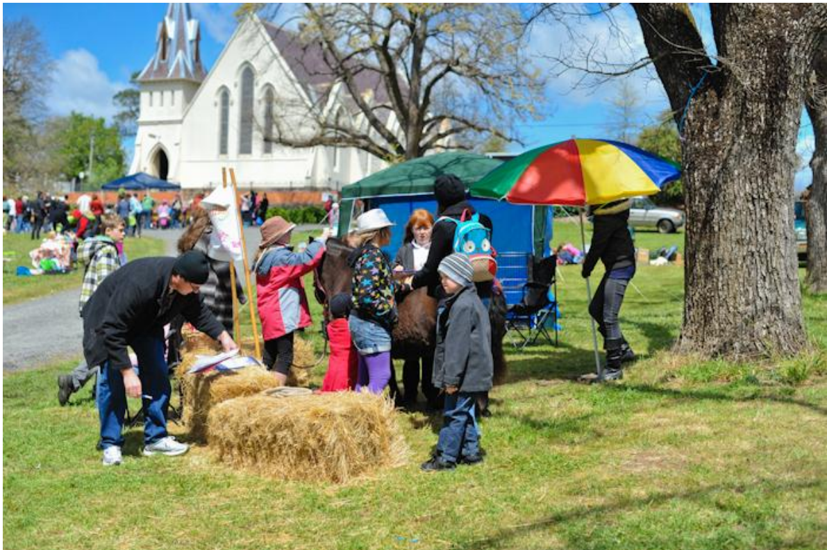
Picture: Children's Activities from the 2011 Good Life Festival