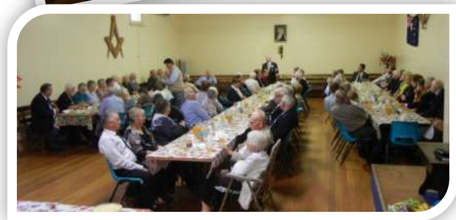
Below: Enjoying the Christmas hospitality of Sturt Buninyong Lodge