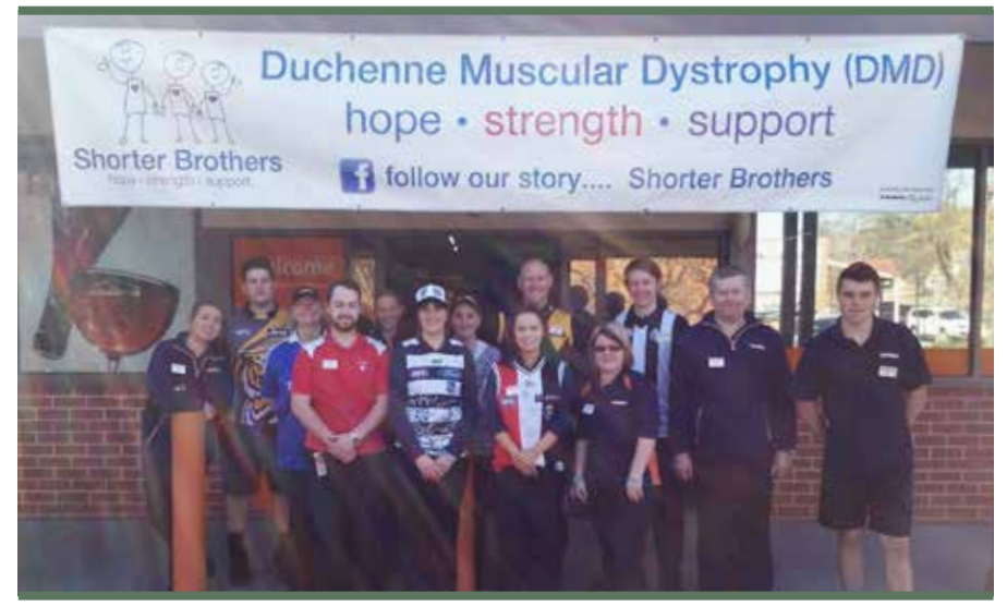
Buninyong Foodworks staff and the Shorter Brothers banner outside the supermarket.

The Foodworks campaign has raised $1400 that will go directly towards ongoing costs and the future needs of the boys. With extended family living locally, the Buninyong Football Netball Club also recently raised money for the Shorter brothers.