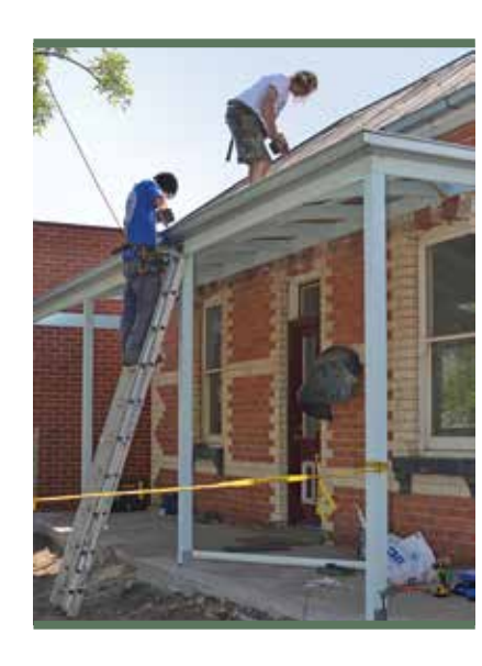
On the house – the boys from Onshore Plumbing working on the heritage veranda at the Community Bank's old cottage restoration project at 407 Warrenheip Street.