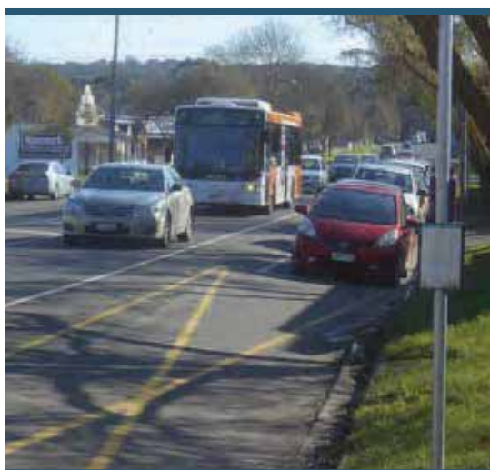
Another bus passes by the empty bus stop area on Warrenheip St while parking there is at a premium.