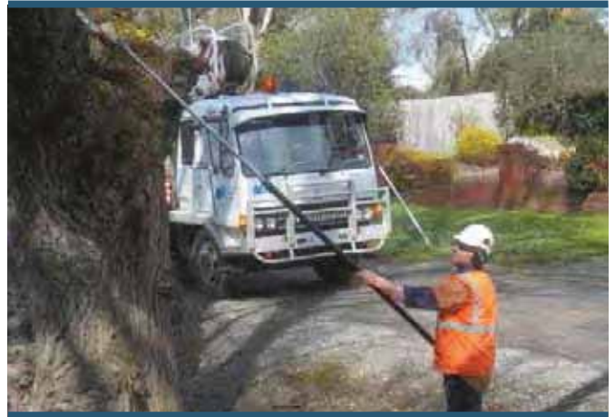
A Council tree-trimming team at work on memorial trees near the corner of Winter and Learmonth Streets.

This second stage of the signage project has been an initiative of the Buninyong & District Community