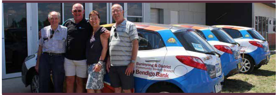
Buninyong and District Community Bank is helping to keep our roads safe and give our kids a better start behind the wheel.

United Way Ballarat has taken on the role of operating Ballarat's successful L2P program in conjunction with VicRoads the TAC and local partners like the Buninyong and District Community Bank. The Bank has funded a vehicle that is