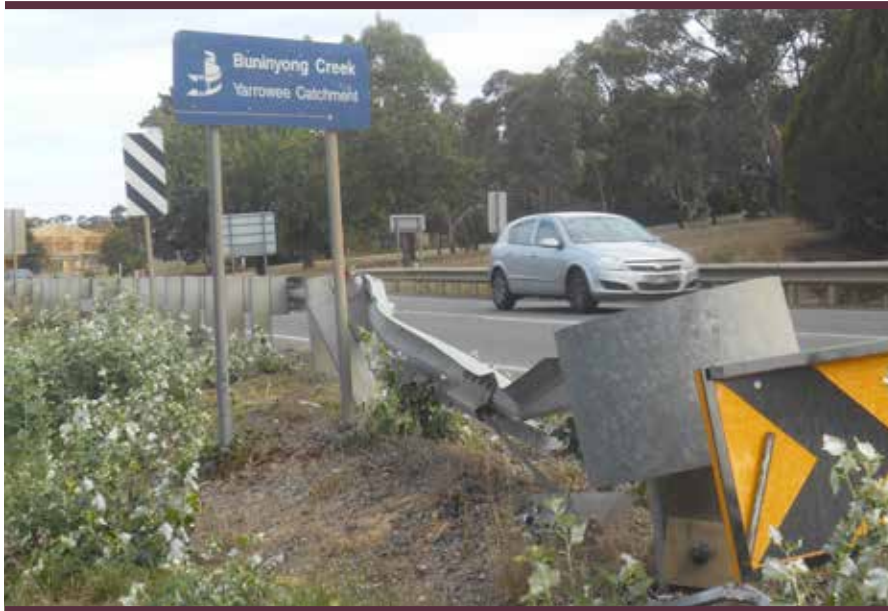
The guard rail of the Midland Highway bridge at Buninyong still shows signs of the many crashes that have occurred there

Vicroads has advised that upgrading works will be undertaken on the bridge over Union Jack Creek near the Buninyong Golf Club in the period 4-9 April. Traffic will be detoured via Geelong Road and the Mt Clear-Sebastopol Road.