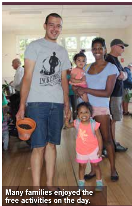
Many families enjoyed the free activities on the day.