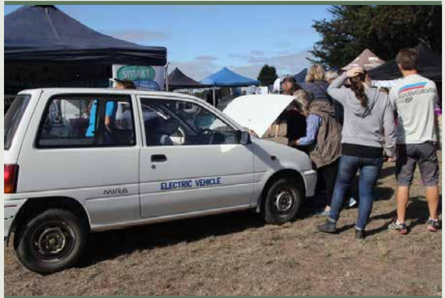
Expo organisers hope to have electric cars at the February event.

After the successful completion of this year's event some businesses signed on immediately for the 2017 Expo, and the early birds have continued to sign up. Sponsors, exhibitors and helpers are being sought Don't get caught up in the Christmas hiatus. Get on board now.