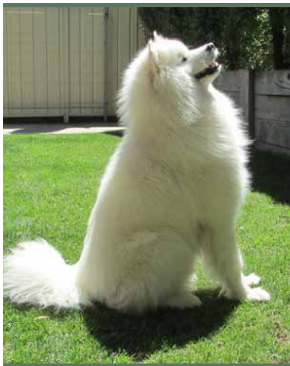
Proud Matsukishi poses for a photo.