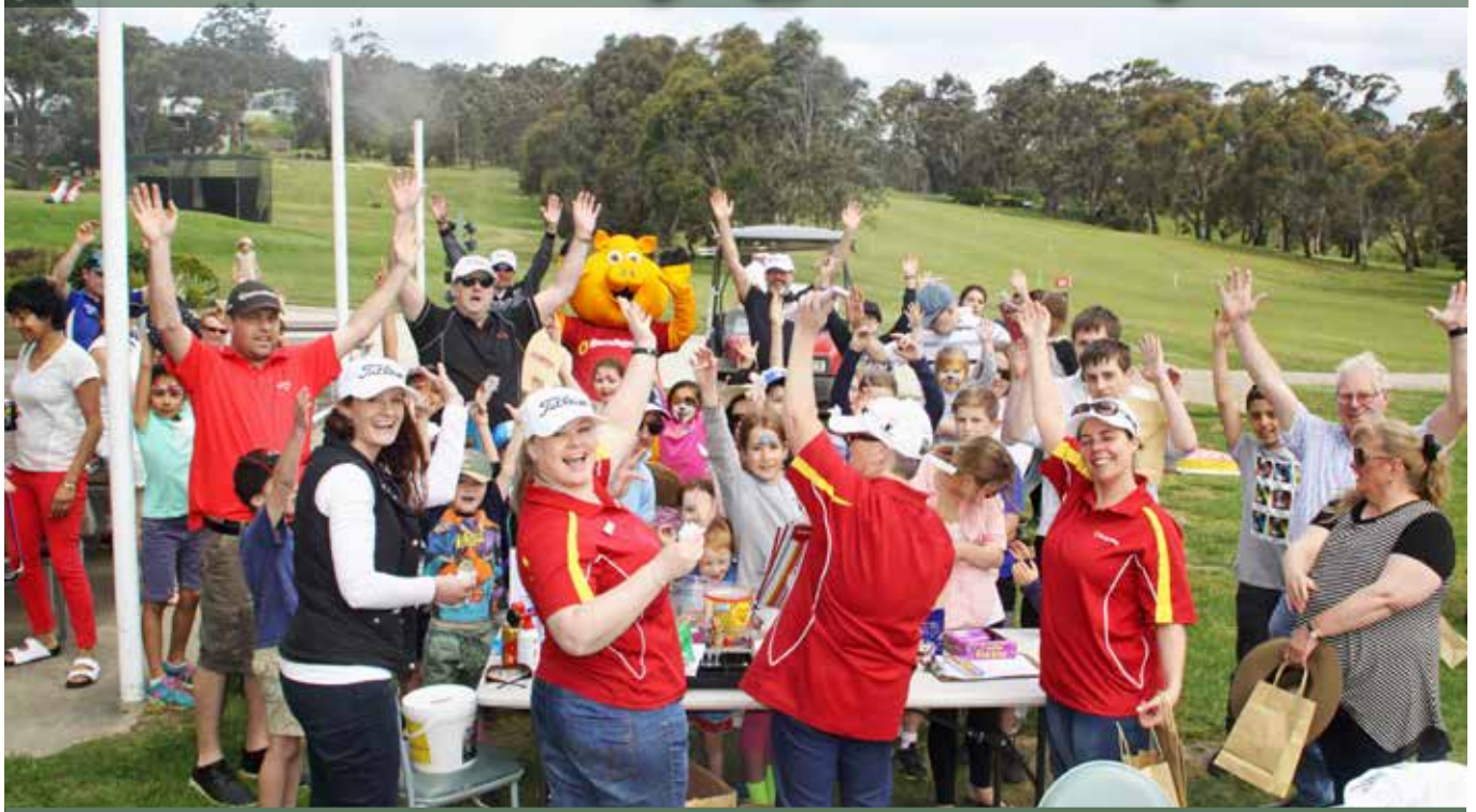
A big cheer for the money raised for the Tee-up for Kids Foundation

Was there a budding Adam Scott or Karrie Webb at the Buninyong and District Community Bank sponsored family golf event at Buninyong Golf club on 30 October?