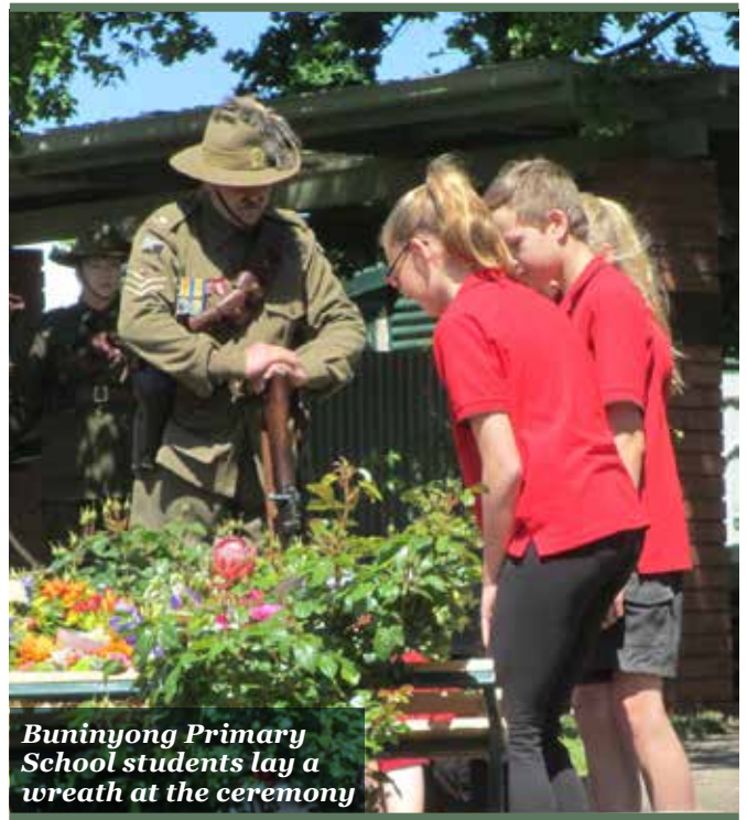
Buninyong Primary School students lay a wreath at the ceremony

At the conclusion of the ceremony members and guests enjoyed morning tea in the RSL Hall.