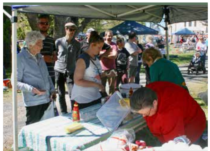
The sausage sizzle was a popular spot around lunch time.

Bronwyn and Lindell believe they were successful in achieving both objectives.