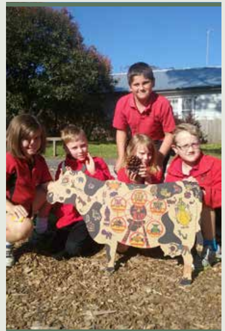
Scotsburn young artists show their work.