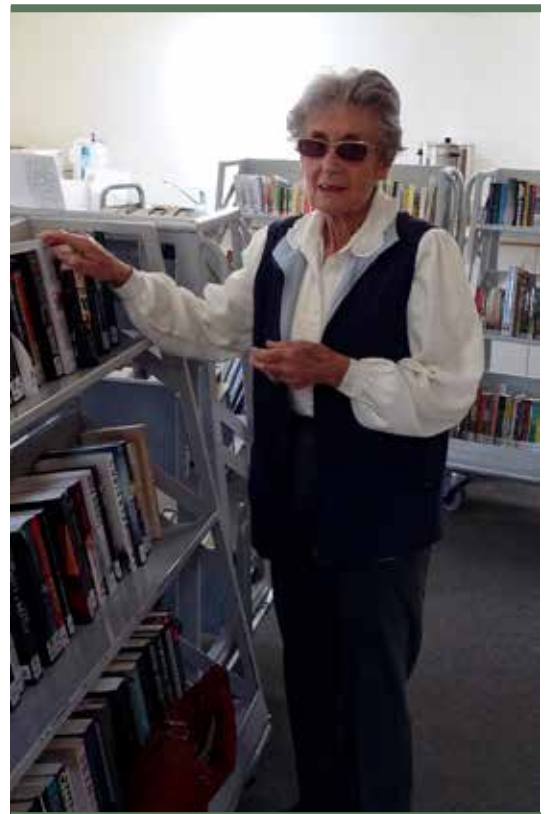
Topsy chooses her books at the Outreach Library

Exceptions apply during extreme weather conditions. Please check the Library's Facebook page or website for more details.