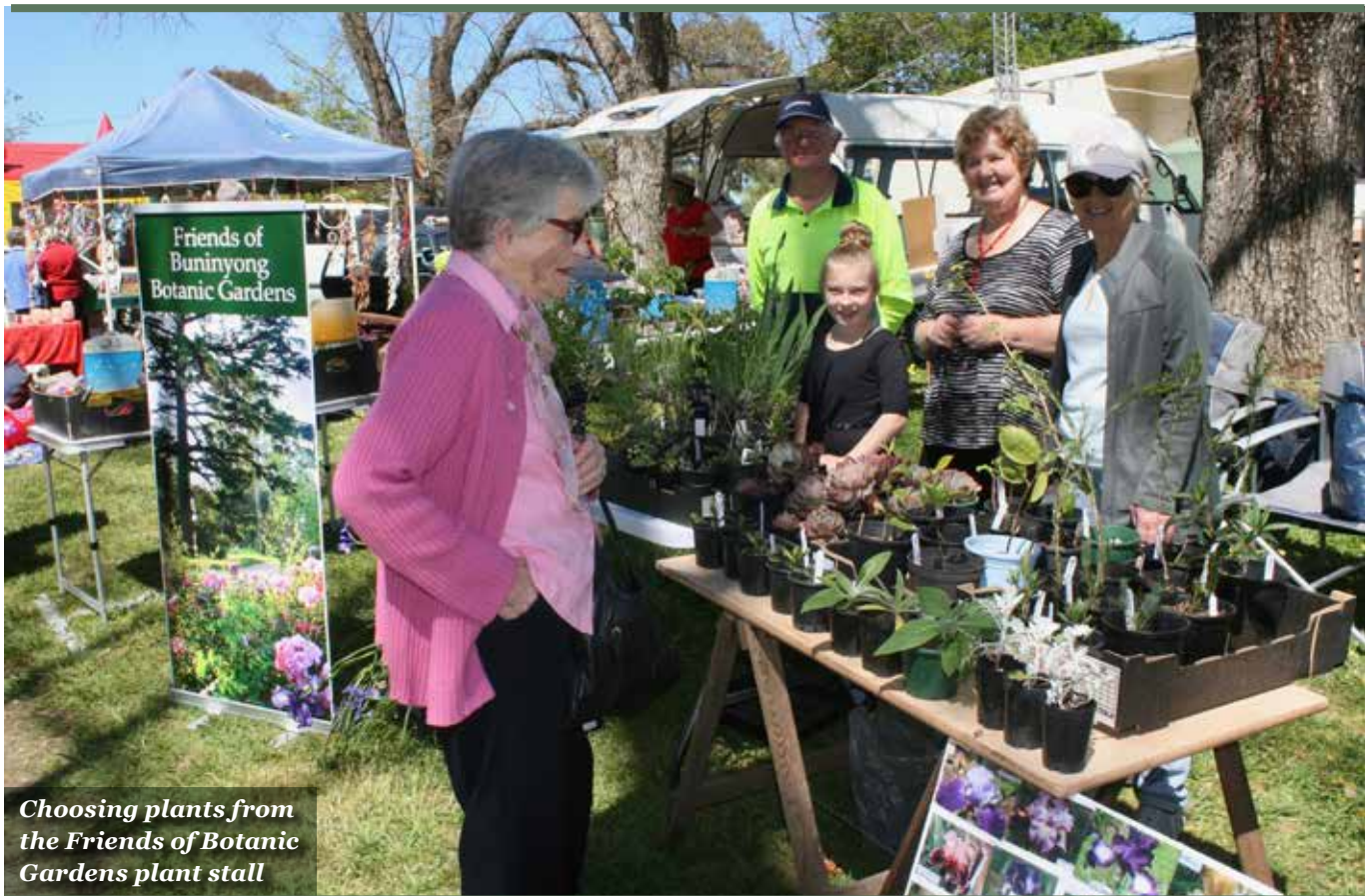
Choosing plants from the Friends of Botanic Gardens plant stall

Blue skies, good music and a relaxed atmosphere - considering the lead-up un-Spring-like weather endured for most of October –made it a pleasure to wander around the grounds of Buninyong’s Uniting Church at their Annual Spring Fete.