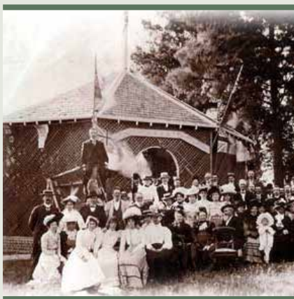
Part of the crowd which gathered at the opening of the rotunda in 1901