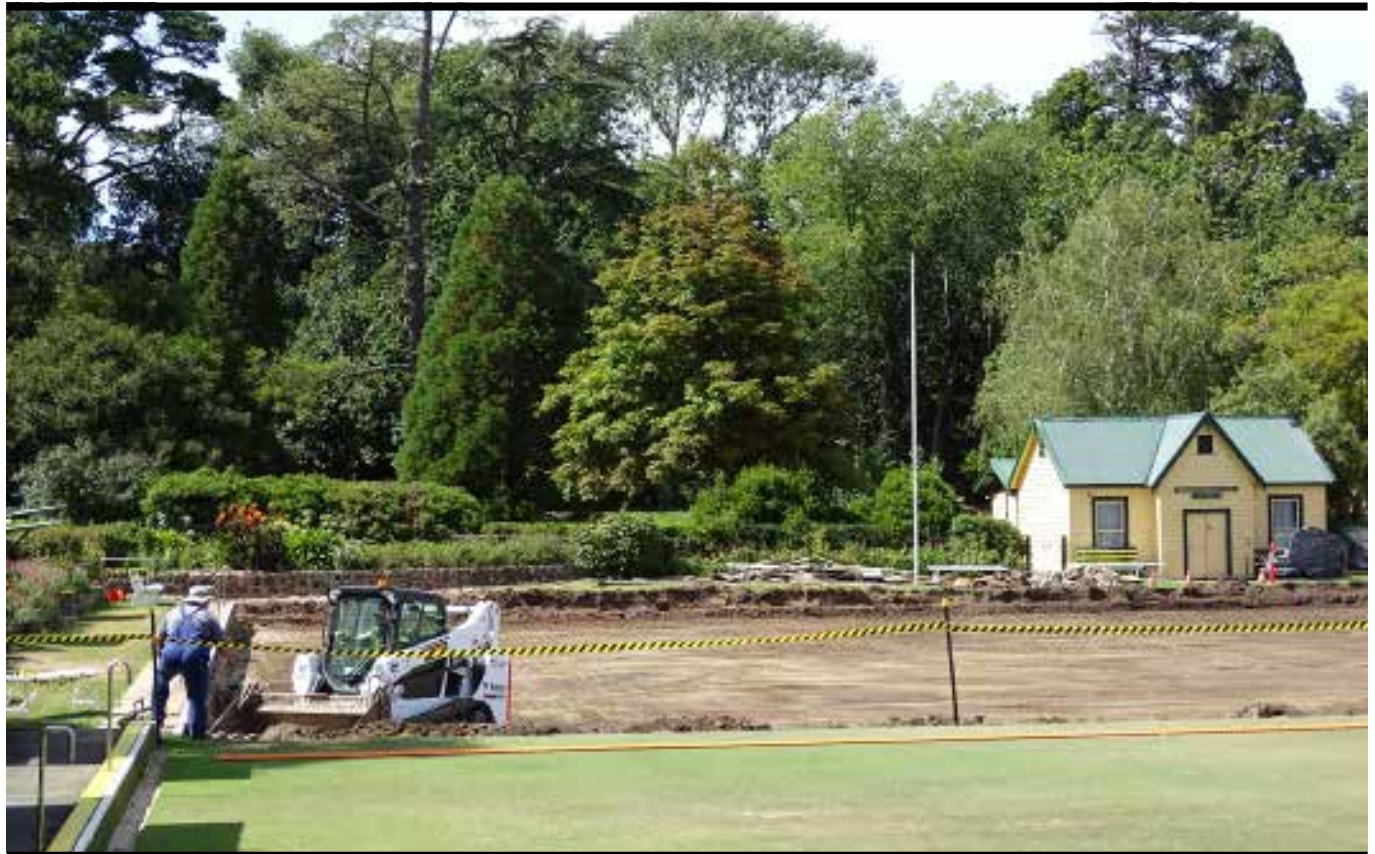
After a major excavation project during April, the new greens are now looking great

Buninyong Lawn bowlers are excited about the new green that has been constructed at Buninyong since the season ended. A new eight rink green replaces the old seven rink green that was ripped up at the end of the season. After only a few months of hard work and favourable weather conditions the green is well on track to be ready for the commencement of the new season.