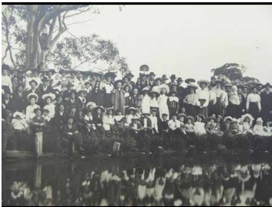
The 1903 church picnic held in the Greenhill paddock attracted a large crowd

"Initially the church was called Scotts Marsh, but when the marsh was drained into a creek in 1889, it became Scotsburn, dropping one 't'. Burn was the Scottish word for creek," she said.