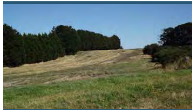
Existing land reserve where Link Road will meet the Midland Highway at Magpie.