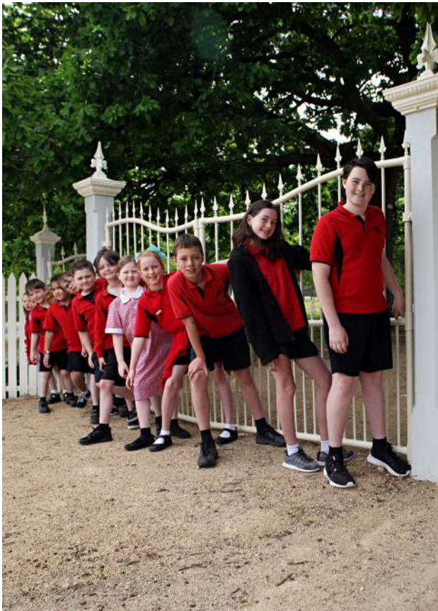
Primary school students check over the refurbished main entry gates to the Botanic Gardens. Council and the Friends of the Buninyong Botanic Gardens worked on the project.