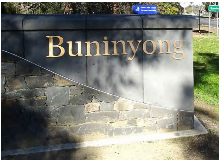
(Left) One of the four stone entrance signs. (Above) The first blue plaque was put up in 2014 outside Whykes' butcher shop, now Espresso Depot.